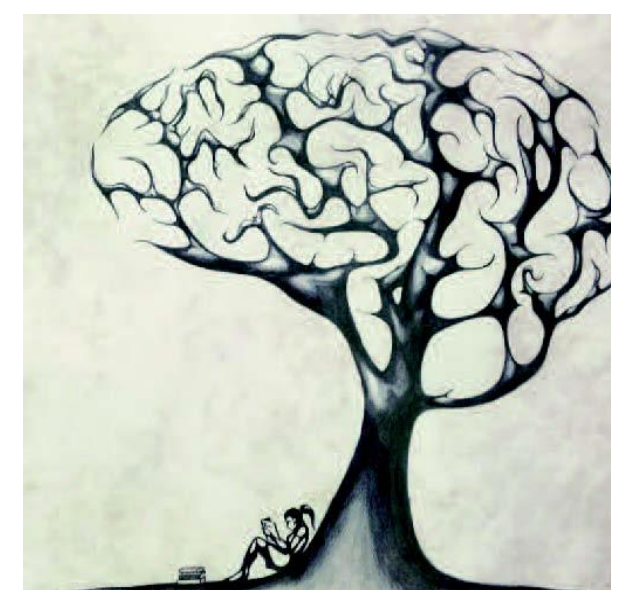
This photo was sketched by a family member of a brain aneurysm patient.

This is also your opportunity to reconnect with your caregivers from EMS/911 operators, to ED staff, physicians and nurses.